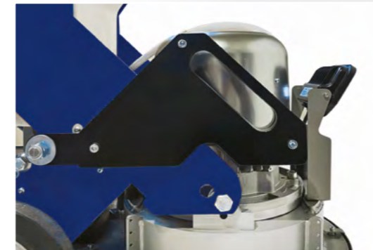
INTEGRATED ADJUSTABLE WEIGHTS SYSTEM

Phantom 501 machine is perfect for heavy duty grinding jobs but also for polishing jobs in medium-space industrial areas and in small civil areas.