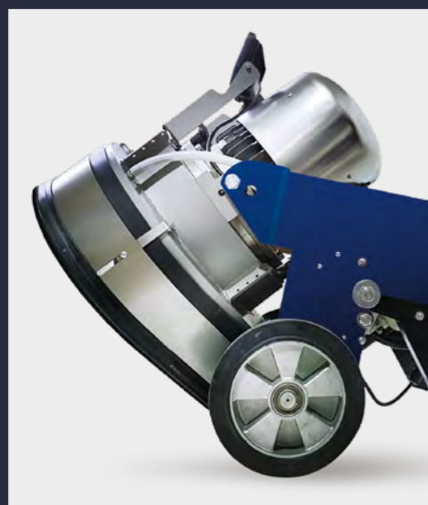
OPTIONAL STAINLESS STEEL ADJUSTABLE BELL allows, during the dry working phases, to let the grinding powders flow back: no more clogging while working.