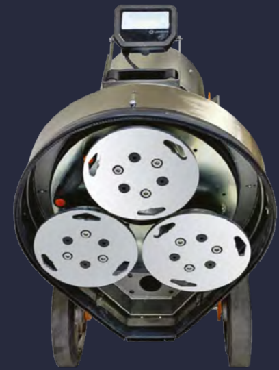
WORKING WIDTH Ø 500mm