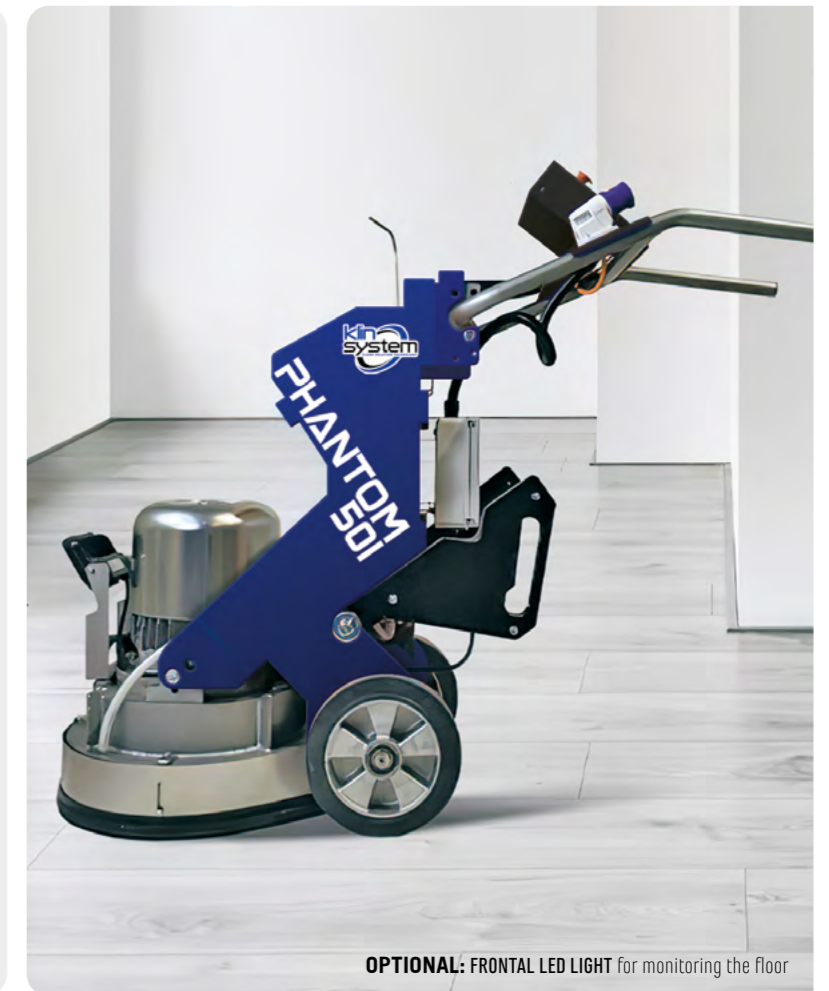
OPTIONAL: FRONTAL LED LIGHT for monitoring the floor