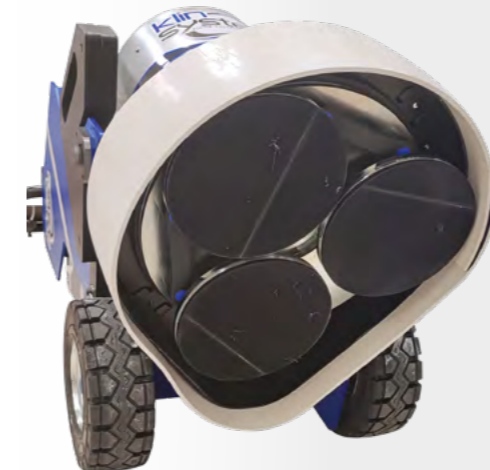
RUBBER SPLASH GUARD (included) - ROBUST RUBBER TIRES