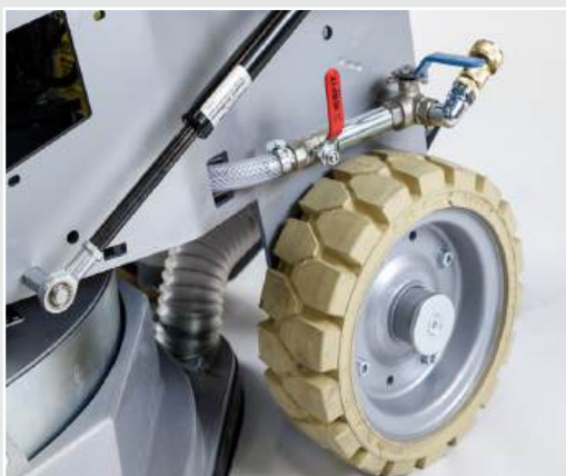
NEW HEAVY DUTY RUBBER TIRES